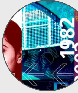
Holmesgleng Institute of TAFE Celebrating 20 years Banner