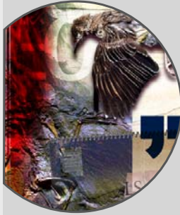
Digital Artwork "Archaeopteryx"