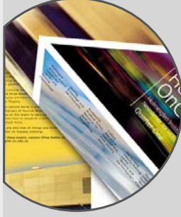
Holmesgleng Institute of TAFE Annual Report 2001