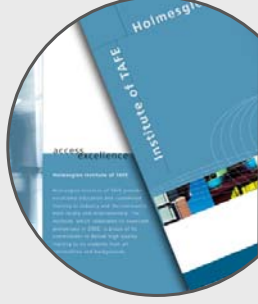
Holmesgleng Institute of TAFE Corporate Brochure